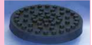
Flask accessory VM-3000FP