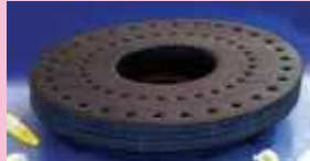
Microcentrifuge tube accessory VM-3000MT