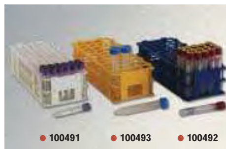
● 100491 ● 100493 ● 100492